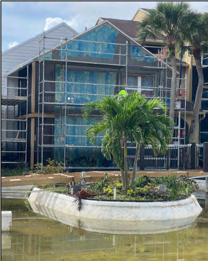
Stucco BLDG 2307