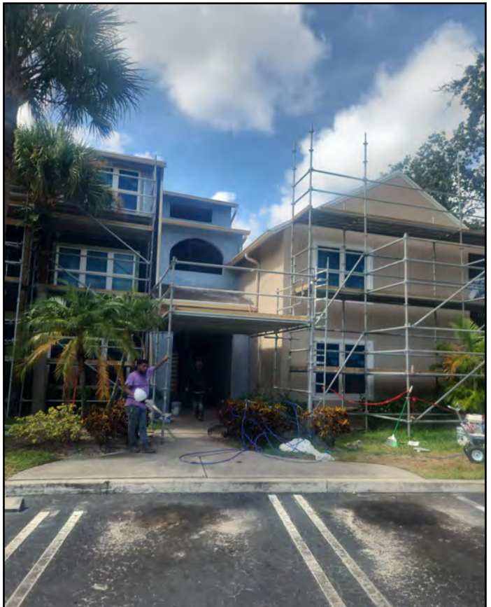
Paint BLDG 2307