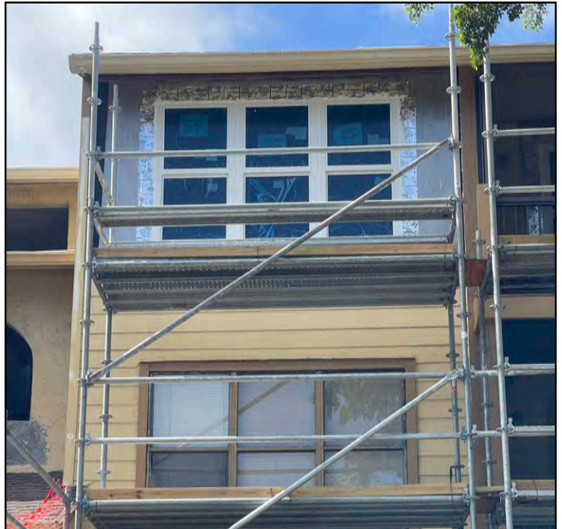
Windows Unit 31