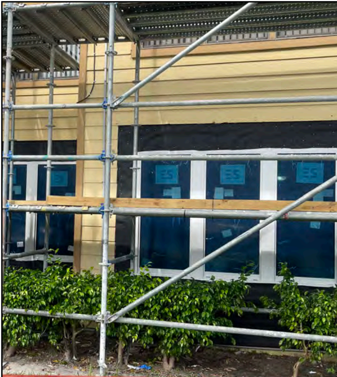
Windows Unit 11